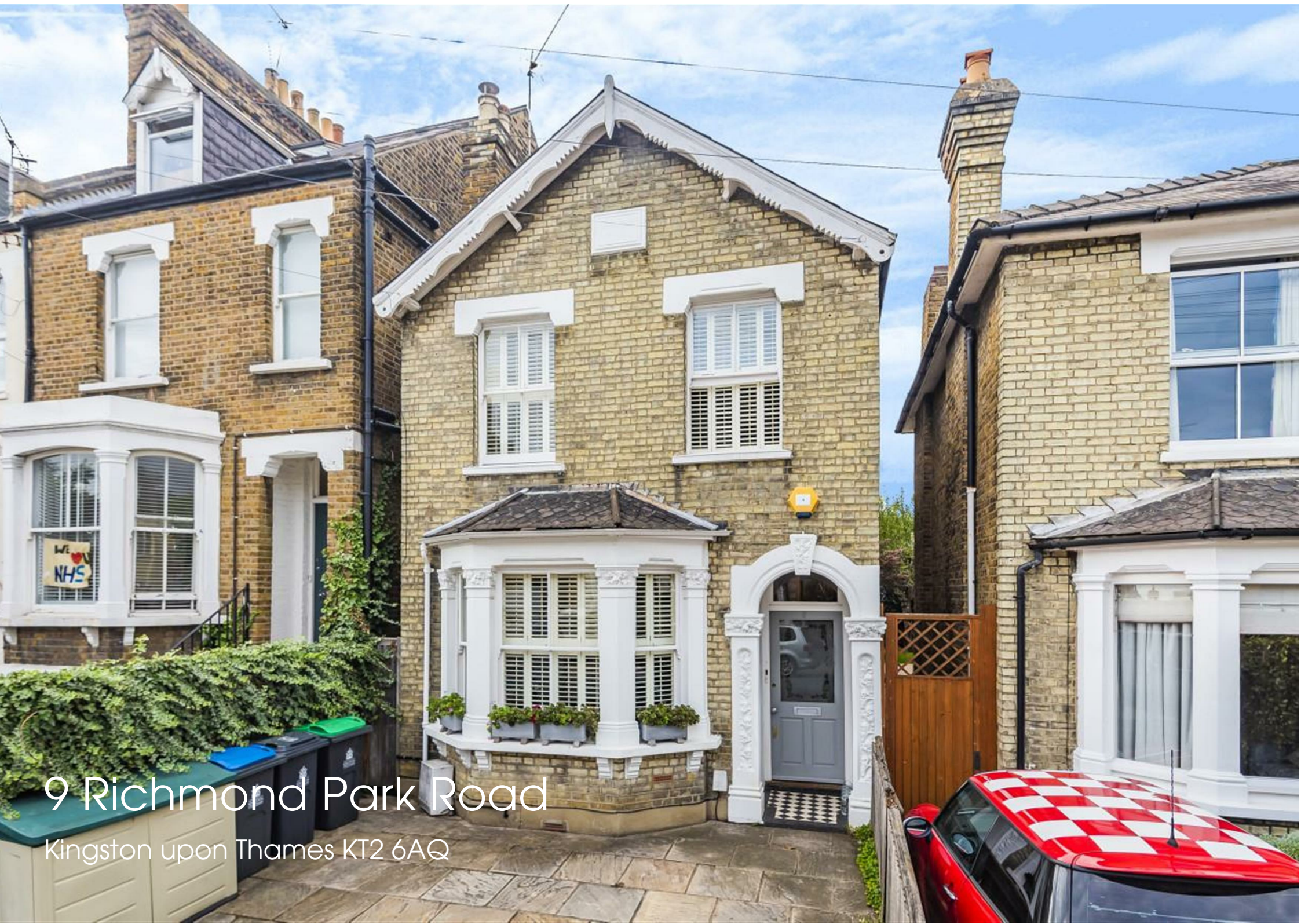
9 Richmond Park Road Kingston upon Thames KT2 6AQ

34 Richmond Road Kingston upon Thames Surrey KT2 5ED www.gibsonlane.co.uk Tel: 020 8546 5444